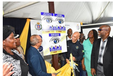
Official launch for 3 Neighbourhood Watch Programmes was an historic event and a first for our island

ties and their executive team. Let us not grow weary in well doing and let us teach the generation coming up the importance of maintaining strong communities.